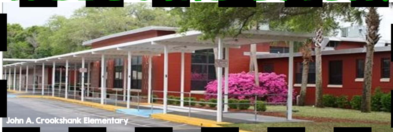
John A. Crookshank Elementary